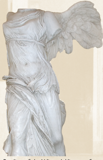
Replica of the Winged Victory of Samothrace statue

carve the figure. The statue was bronzed and presented to the Idaho Territory in 1869. It was displayed on the Capitol grounds until 1934, when it was brought indoors due to weather damage. The statue was repaired, restored, and covered with gold leaf in 1966.