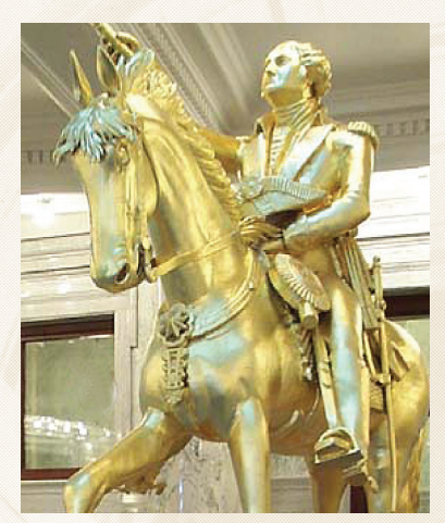
George Washington Statue

Public galleries for the House and Senate are located on the fourth floor. As you walk to the public seating, notice the painted concrete floor. Though not marble, the floor mimics the colors and style of the marble floors below.