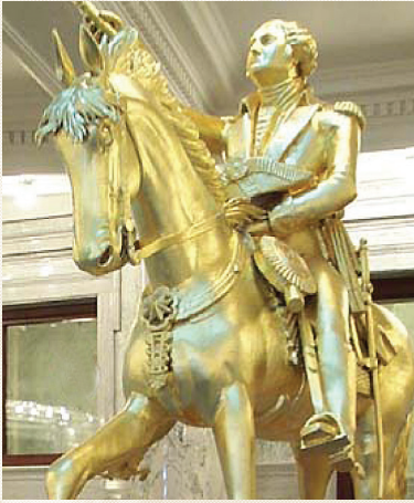
George Washington Statue

Public galleries for the House and Senate are located on the fourth floor. As you walk to the public seating, notice the painted concrete floor. Though not marble, the floor mimics the colors and style of the marble floors below.