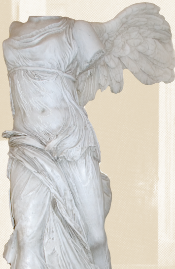
Replica of the Winged Victory of Samothrace statue

carve the figure. The statue was bronzed and presented to the Idaho Territory in 1869. It was displayed on the Capitol grounds until 1934, when it was brought indoors due to weather damage. The statue was repaired, restored, and covered with gold leaf in 1966.